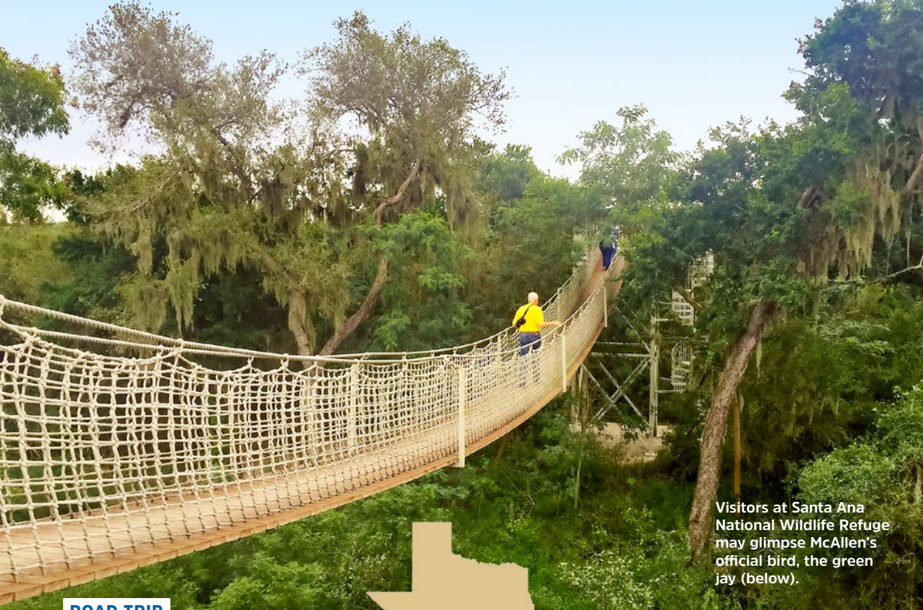
Visitors at Santa Ana National Wildlife Refuge may glimpse McAllen's official bird, the green jay (below).